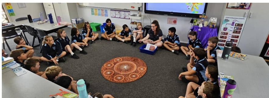
3/4HM enjoying their Yarning Time around their Yarning Mat.

We certainly aim for excellence and acknowledge that we can improve to achieve the expected high standards. We are always happy to receive feedback which is valued and respected in helping us shape the work of the school.